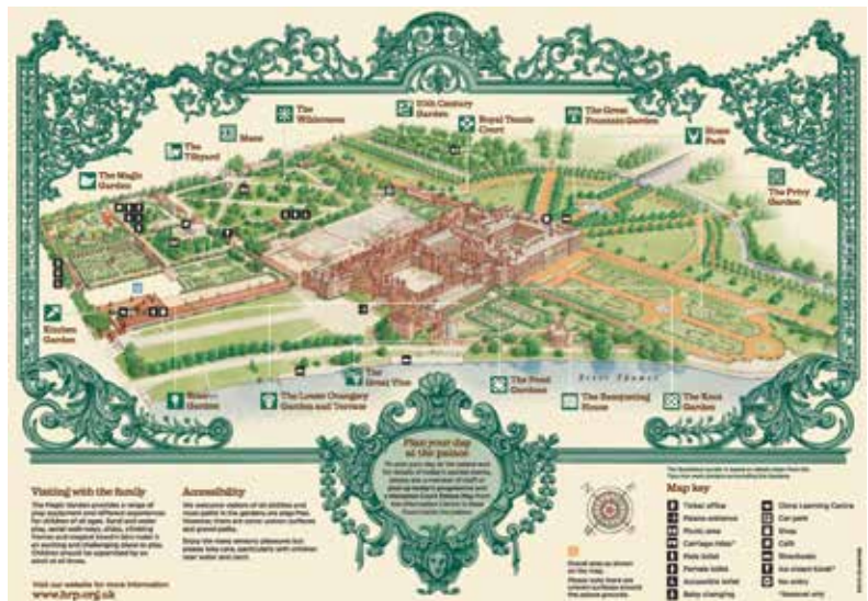
TOP TO BOTTOM Toadstool-shaped yew trees; Map of the current gardens at Hampton Court Palace.

This was created by William III and Mary II to complement their new baroque-style palace. Their gardener, Daniel Marot, created a garden containing 13 fountains, of which only one remains today, and planted two radiating avenues of yew trees ( Taxus baccata ) in the fashionable form of a goose foot. Initially, the yew trees were kept neatly pruned. Subsequently in the mid-18th century, Capability Brown, who was