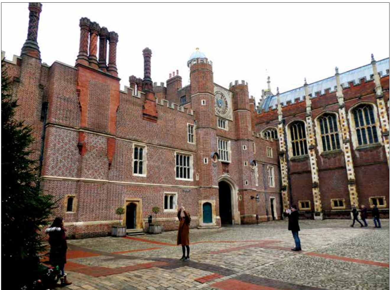
BELOW The Courtyard with chimneys.

Henry VIII had the garden arranged with a central path and ten sections on either side,